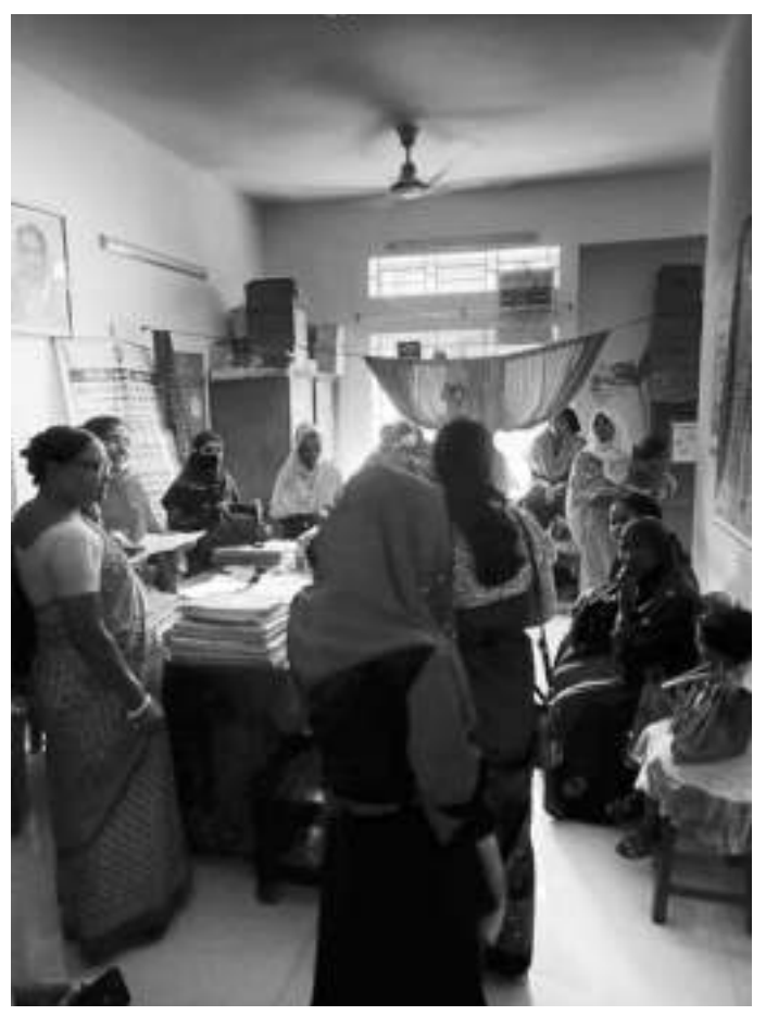
"Often we hear that women and girls take medicines either to delay or stop their menstruation so that they can work in the water without hassle. Due to the poverty they cannot afford to take a day off work during their menstruation and are compelled to work in the water where the salinity is increasing due to climate change. As a consequence these issues are causing them to suffer many uterine diseases" -Service provider from Upazila Health Complex.

To safeguard and ensure the SRHR of people who are most marginalised and vulnerable due to climate change, it is important to take a comprehensive approach that integrates gender-responsive strategies into climate change adaptation and mitigation measures. This involves addressing the underlying gender inequalities and power dynamics that contribute to exacerbating vulnerabilities for marginalised communities.