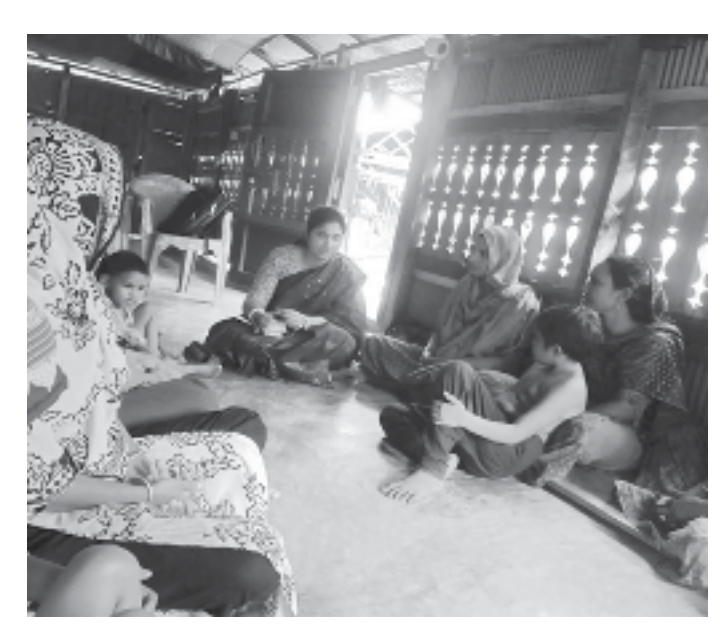
Many women are facing Leukorrhea which is one of the most common consequences of staying in salty water for long periods. Moreover, women feel shy to discuss it, especially young girls who feel more uncomfortable even in front of the health service providers. They think that it is something that should not be shared with anyone.